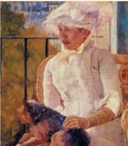
Woman with Dog, Mary Cassatt

Lab technicians, dietitians, radiographers, and employees in security, maintenance, environmental services, and food and nutrition are among the many people who make your hospital stay as beneficial and comfortable as possible.