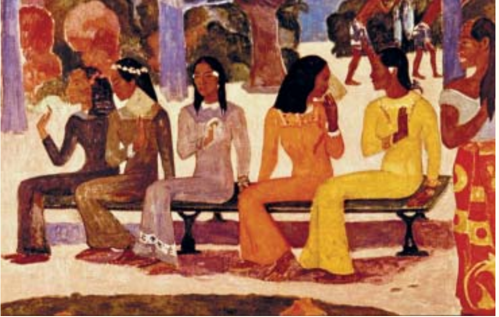
The Market, Paul Gauguin

“In all things of nature there is something of the marvelous.”