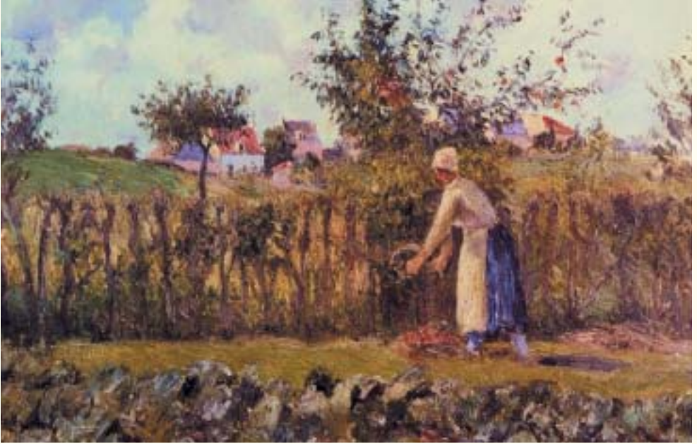
In the Orchard, Camille Pissarro

“If anything is sacred, the human body is sacred.”