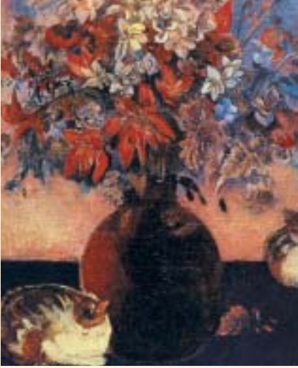
Flowers and Cats, Paul Gauguin

“He who has health has hope, and he who has hope has everything.”