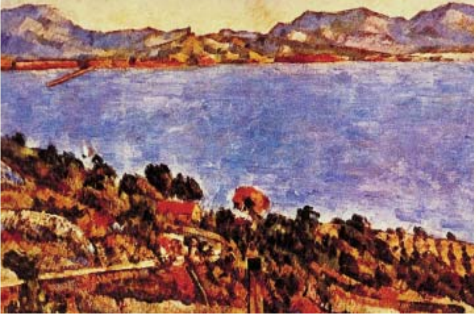
Gulf of Marseille, Paul Cezanne

“Just don’t give up trying to do what you really want to do. Where there’s love and inspiration, I don’t think you can go wrong.”