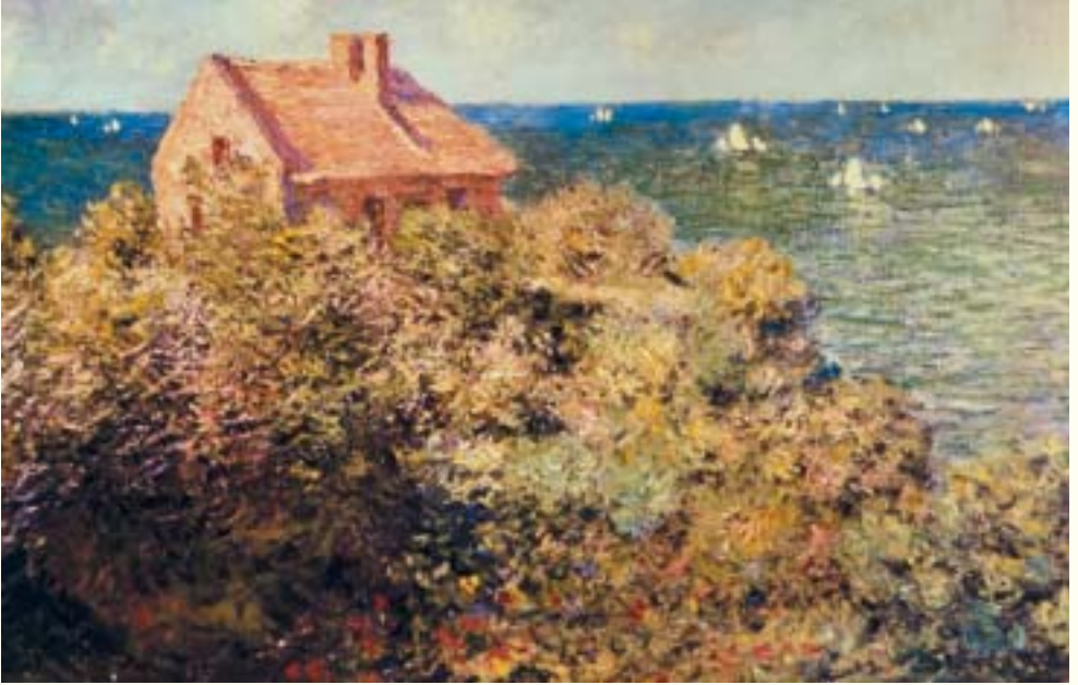
Fisherman's Cottage on the Cliffs at Varengeville, Claude Monet

“Little drops of water, Little grains of sand, Make the mighty ocean And the pleasant land.”