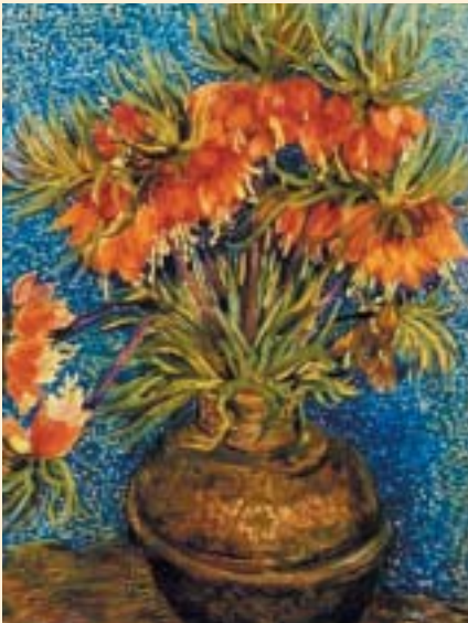
Fritillaries , Vincent van Gogh

If you have a concern about your medical care or provider but do not wish to discuss it with your care team, contact a patient advocate at 8-8777. Patient advocates are available from 8 a.m. to 5 p.m. on weekdays. At other times, you can leave a message or contact the charge nurse to find the appropriate person. He or she will follow up with you the next business day.